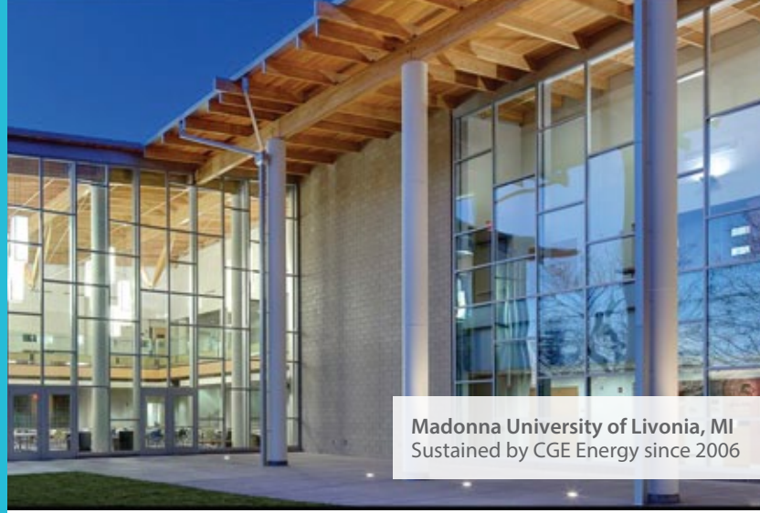
Madonna University of Livonia, MI Sustained by CGE Energy since 2006